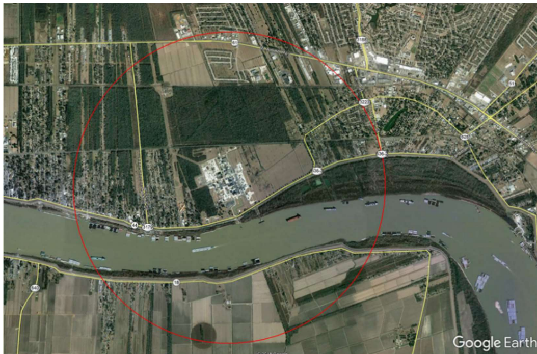
Figure 1: Image obtained from Google Earth of 2.5-kilometer survey area radius around the Denka Performance Elastomer facility in Laplace, La.

Due to the COVID-19 pandemic, the door-to-door surveying was suspended as of March 19, 2020. A multipronged approach was implemented instead of door-to-door surveying. Project flyers were mailed to all the residents obtained from the St. John Parish public geoportal. Phone registries were purchased for the survey area, and field workers contacted residents if they were interested in participating and completing a survey. Businesses and religious organizations in St. John Parish were contacted and sent project flyers to distribute to the congregation.